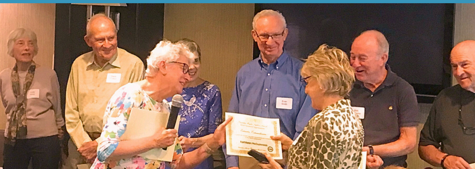
Volunteer Appreciation Lunch, April 17