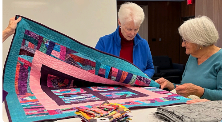
A quilt being shown at FHNN's Crafts & Chat

There's an abundance of local organizations that connect older adults with the arts. Check out some resources below and get artsy this May.